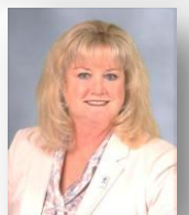
Submitted by Becky Moser District Governor